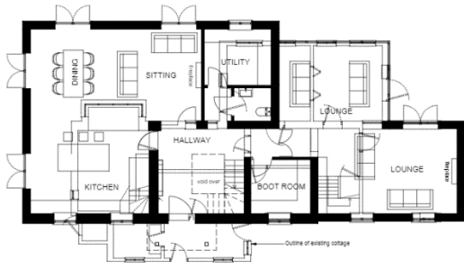
Ground floorplan Existing and Proposed