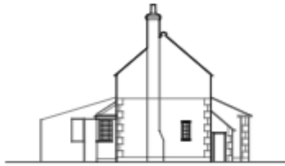
Existing East Elevation