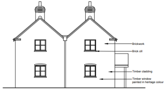
Proposed East Elevation