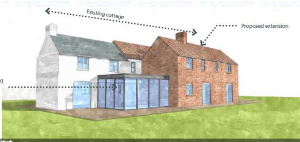
Fig. Proposal - sketch visuals

Jarden room to replace the existing rain-to extension